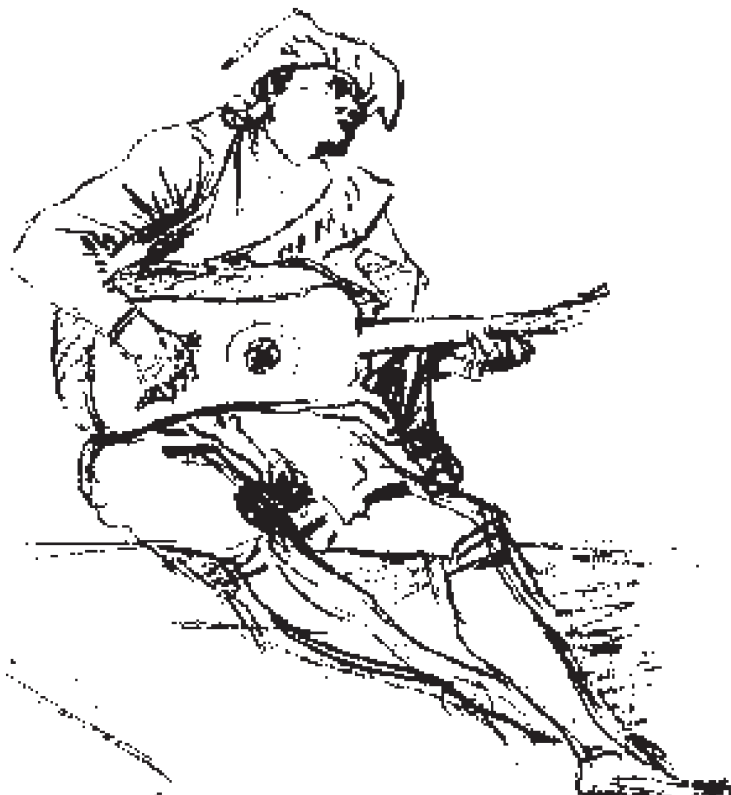
Antoine Watteau, British Museum Collection