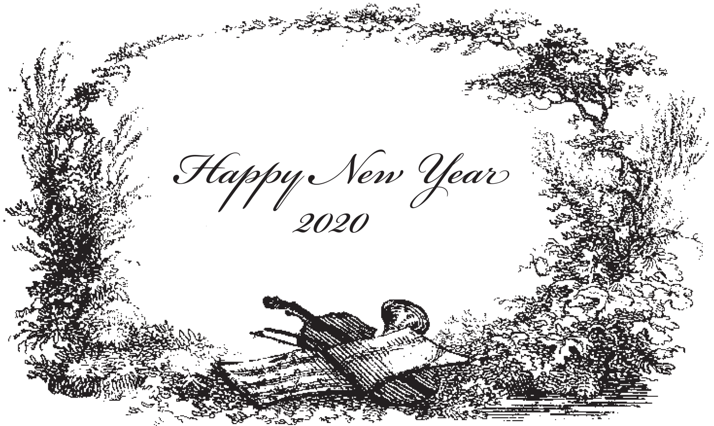
cartouche from the British Museum Collection