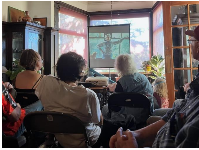
Screening the rough cut