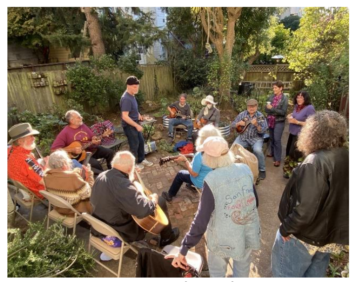
Jamming in the garden

the documentary in 2024. We are deeply grateful to everyone who has contributed.