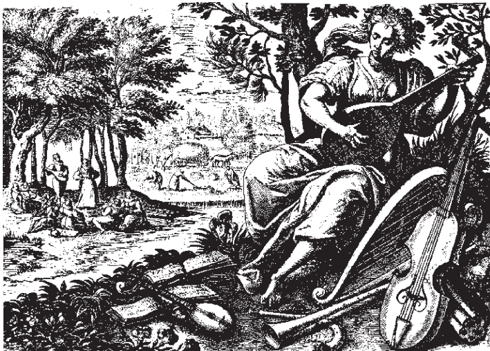
Summer, ca. 1590, British Museum Collection