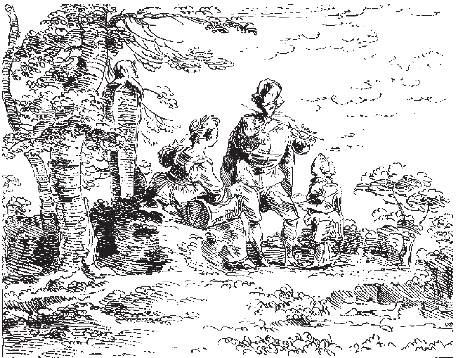
British Museum Collection, after Claude Gillot, ca. 1720

Any changes or additional information will be announced in the next issue of the folknik : May/June, 2019.