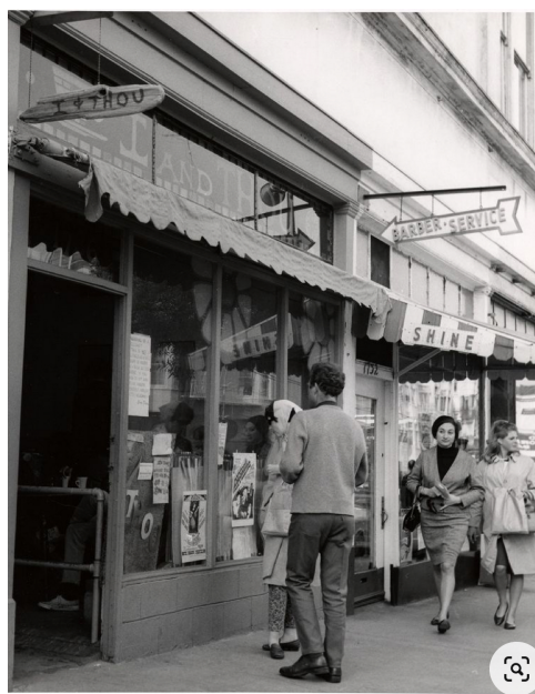
I and Thou Coffeehouse, Haight Street

http://old.sffmc.org/archives/jan10/rothkop.html