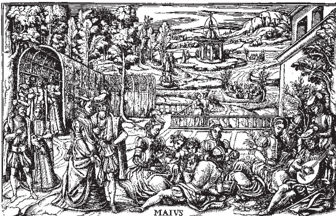
May, anonymous woodcut, ca. 1580, British Museum Collection

Membership forms (for new members and renewals) are available at the registration table and also online at www.sffmc.org . A SFFMC membership form link is at the bottom of the sffmc.org Home Page.