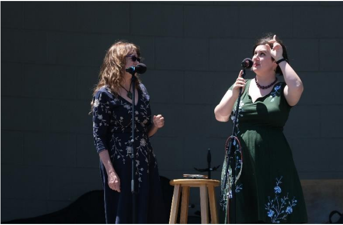
Performance: Yes M'am