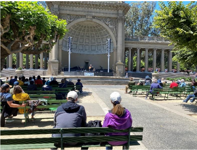
The bandshell stage at Golden Gate Park