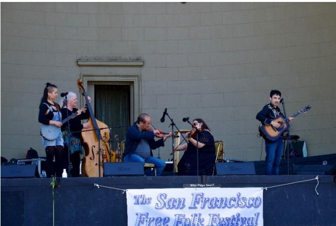
Performance: The Corn Lickers