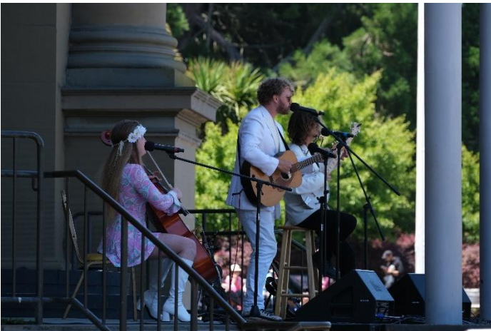
Performance: The Under Trio