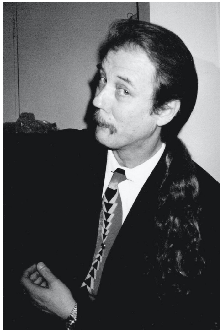
Tony Rice backstage, Mystic Theater, Petaluma, Feb 21, 1999, Tony was 47+ years old.