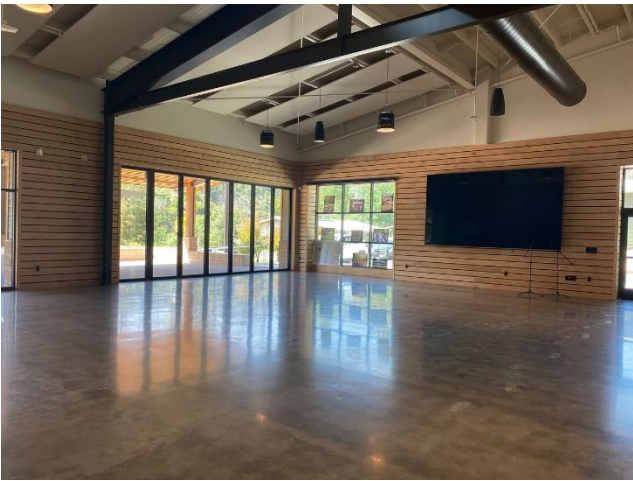
Dining hall 3