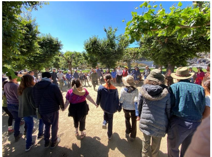
A dancing workshop, probably Easy Balkan Dancing or Klezmer