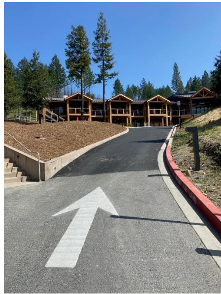
New housing exterior 1