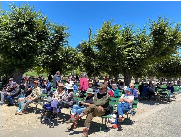
Seating for the bandshell stage