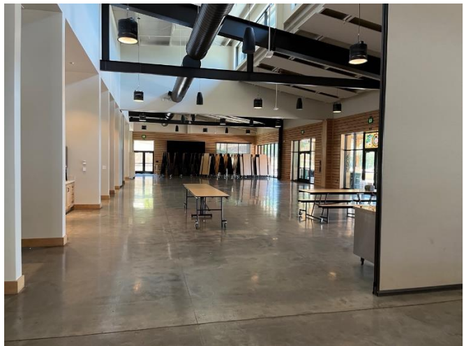
Dining hall 1