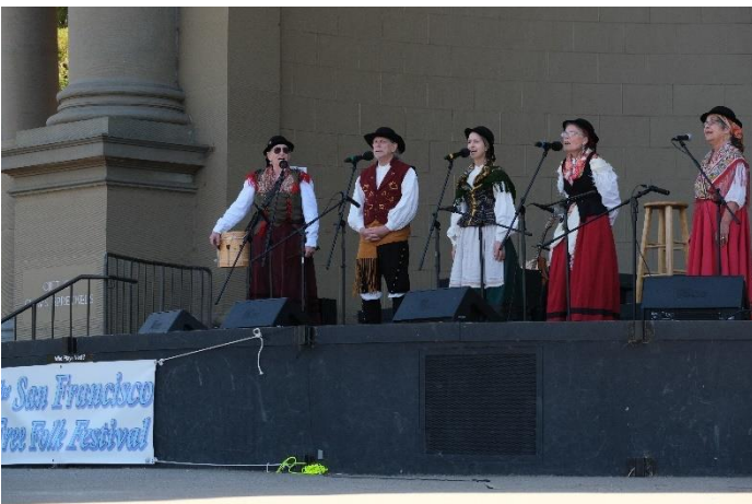
Performance: As Meigas