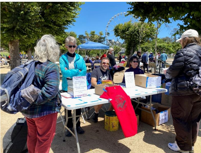
Volunteers at the folk club information table.