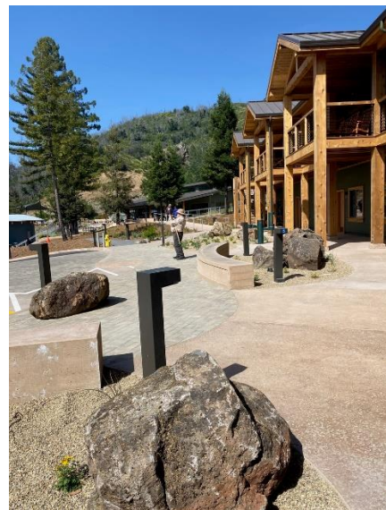
New housing exterior 3