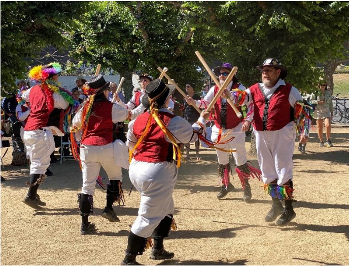
Morris Dancing workshop