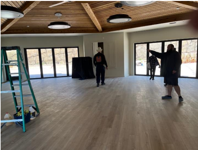
Singing workshop room