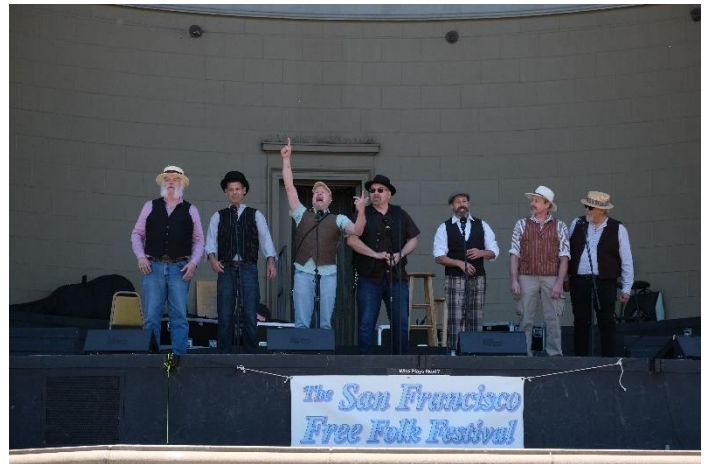
Performance: Brass Farthing