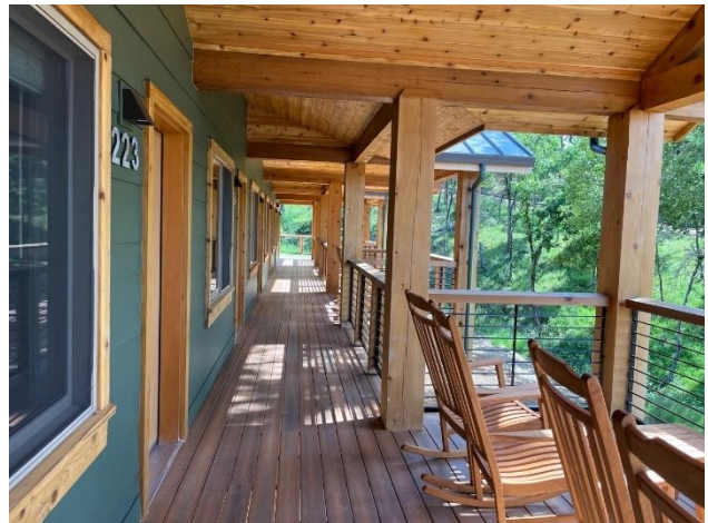
New housing exterior 2