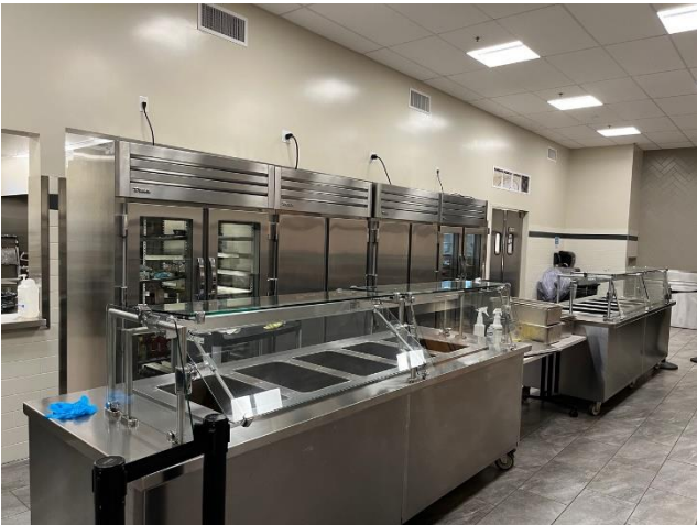
Dining hall 4