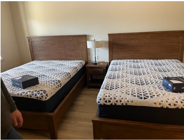
Room in new housing