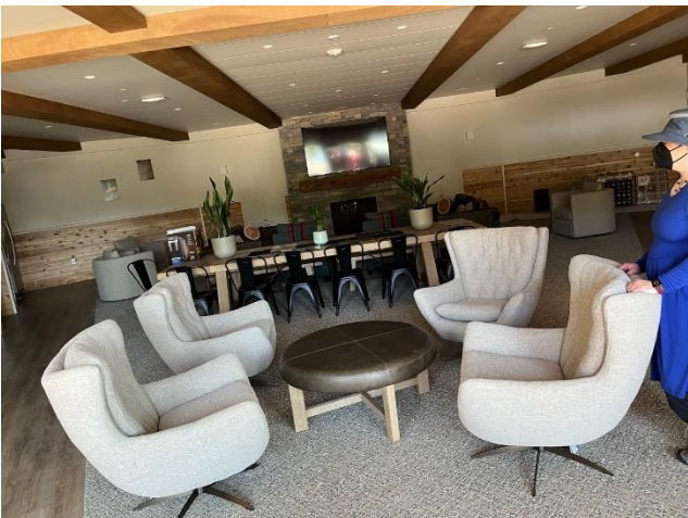
Lounge in new housing