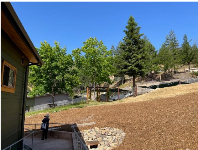
View behind dance hall